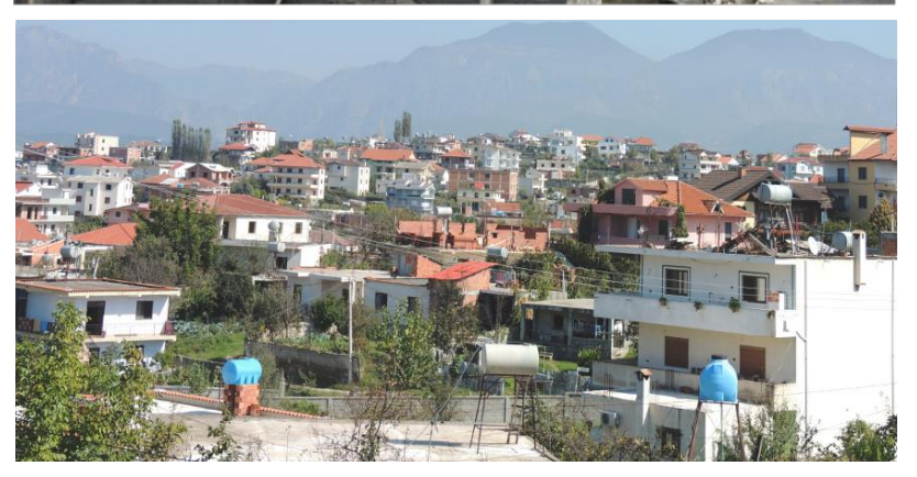
Bathore 1994, 2007, and 2014

Through a series of confusing laws in the 1990s most of the land was re-privatised with a combination of recognising pre-communist ownership and distribution between local citizens. Some rural land was reserved for agricultural enterprises which never materialised. Many new landowners and people who moved to the cities built their houses on rural land at the periphery of cities or simply squatted on publicly owned land and built homes there. This spontaneous piecemeal construction was typically started by people related through family or place of origin and varied in size (1000-10000 inhabitants) and quality (from simple 1-bedroom homes to 3-storey villas). Almost all buildings were residential and no infrastructure or services were considered - roads, water, sewage, electricity, education, health etc.