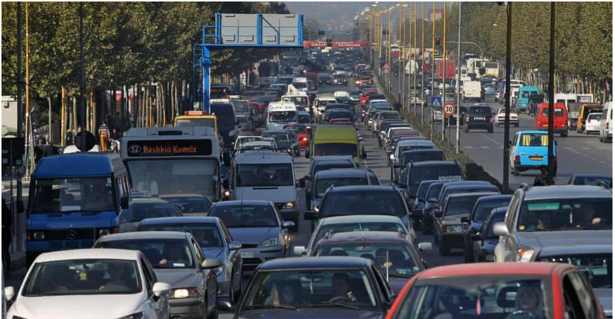
Traffic gridlock in Tirana

Today Tirana is ranked as one of the most polluted cities in the world (38th) with one car for every two inhabitants. In keeping with its aspirations of becoming a coveted European capital, Tirana must rapidly upgrade its transport strategies to prioritise the movement of people , giving residents and visitors a wider variety of attractive transport options.