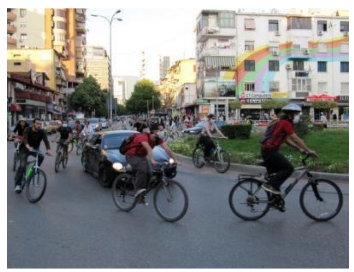
Critical Mass, Tirana 2014

The good news is that Tirana is in a favourable position to support a transition to alternative modes of transport, as its terrain is mostly flat and it is a compact city with work, services, and social contacts typically within walking distance. Current feasibility studies on mobility and sustainability recommend high impact and low cost strategies for Tirana.