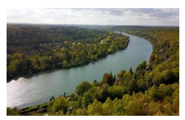
THE SEINE IN NANDY

The Vallée de la Seine is subject to various and even contradictory objectives: as an instrument for economic development, a biodiversity reserve, etc. The objective of the workshop is to explore these different dimensions and to propose to the Grand Paris Sud Urban Authority several broad strategies for the Vallée de la Seine.