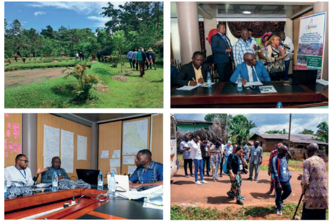
Images a from previous workshop in Cameroon

8-9 July: Urban planning lessons , a final work phase with the 6-city representatives and the planning consultancy firm