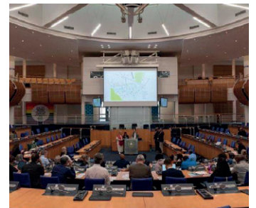
Images from previous workshops