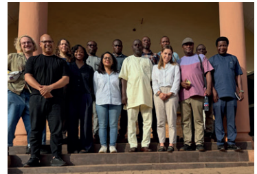
Photos from the exploratory mission in Greater Tamale, February 2026