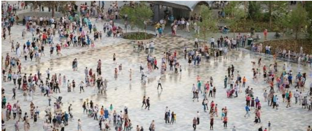
Tirana City Centre | Skanderbeg Square

The Lonely Planet describes Tirana, Albania's capital city, as one bustling with vigour and a burgeoning confidence fuelled by old-world hospitality and a refashioned aesthetic. Bland, concrete-grey buildings are now canvases for a Pantone rainbow of creativity. What gives the urban tableau its flavour is the juxtaposition of culture and eras. In the city center, communist era and modern buildings can be seen alongside an Ottoman mosque and Mussolini style government buildings from the 1930s. The city is a study of contrasts where reminders – and the reinterpretation – of an iron-fisted, post-WWII communist legacy are scattered around a metropolis where a strong and dynamic generation is growing up without being influenced by the legacy of the past.