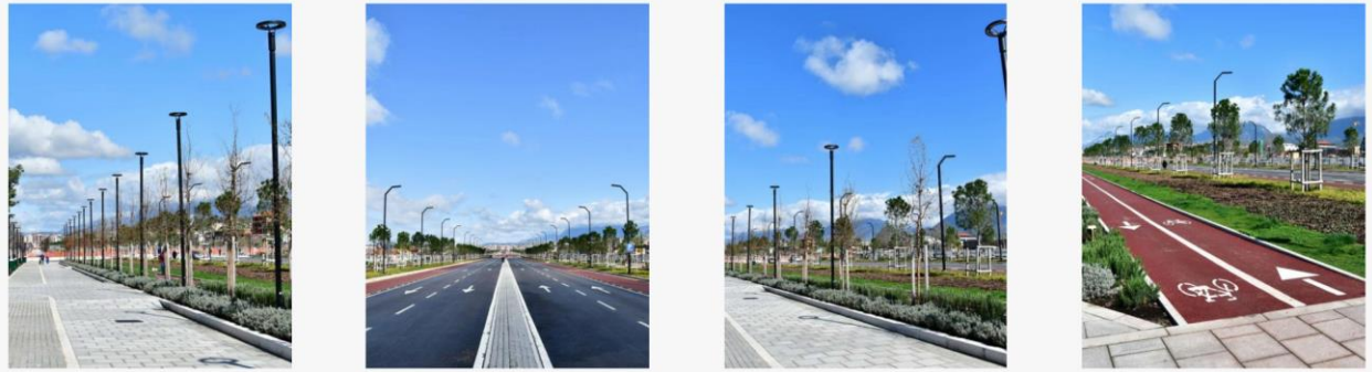
Tirana North Boulevard