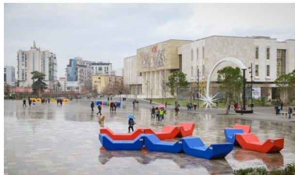
Skanderbeg square, Tirana's nerve centre and symbolic site for the whole country, reflects Albania's complex, convulsive history. Left: Plaza Tower, the Mosque Et'hem Bey & the City Hall; Right: National Museum