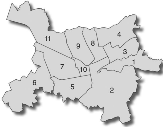
Districts of Tirana city (urban core)

Albania underwent an administrative and territorial reform in 2014 that completely changed the map of the country. Defunct communes were merged with municipalities, reducing 400 local units to 61. Before this, Tirana city's area was only about 31 km 2 . Since the reform and the consequent merging of districts, the municipality of Tirana governs an area of 1110 km 2 . The new municipality of Tirana consists of 24 administrative units, comprising of 11 districts of Tirana city and 13 neighbouring districts (which were added to the existing municipality of Tirana), namely Petrelë, Farkë, Dajt, Zall-Bastar, Bërzhitë, Krrabë, Baldushk, Shëngjergj, Vaqarr, Kashar, Pezë, Ndroq and Zall Herr.