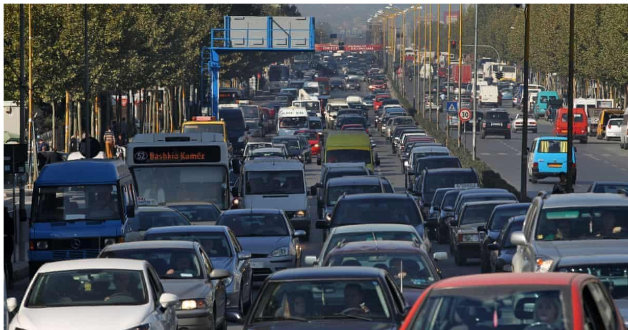
Traffic gridlock in Tirana

Today Tirana is ranked as one of the most polluted cities in the world (38th) with one car for every two inhabitants. In keeping with its aspirations of becoming a coveted European capital, Tirana must rapidly upgrade its transport strategies to prioritise the movement of people , giving residents and visitors a wider variety of attractive transport options.