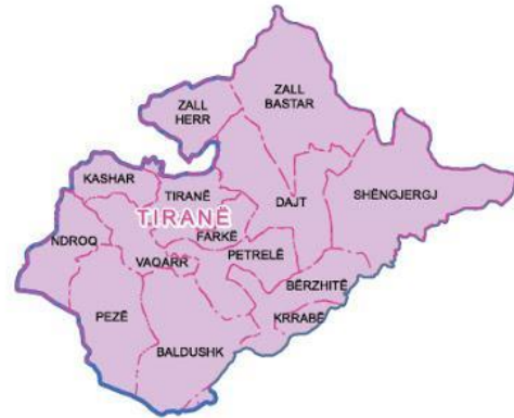
Admin units of Tirana Municipality (Tirana City + 13 districts)

Tirana's new metropolitan territory can be better understood as three distinct geographical areas: