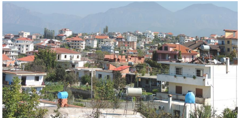
Bathore 1994, 2007, and 2014

Through a series of confusing laws in the 1990s most of the land was re-privatised with a combination of recognising pre-communist ownership and distribution between local citizens. Some rural land was reserved for agricultural enterprises which never materialised. Many new landowners and people who moved to the cities built their houses on rural land at the periphery of cities or simply squatted on publicly owned land and built homes there. This spontaneous piecemeal construction was typically started by people related through family or place of origin and varied in size (1000-10000 inhabitants) and quality (from simple 1-bedroom homes to 3-storey villas). Almost all buildings were residential and no infrastructure or services were considered - roads, water, sewage, electricity, education, health etc.