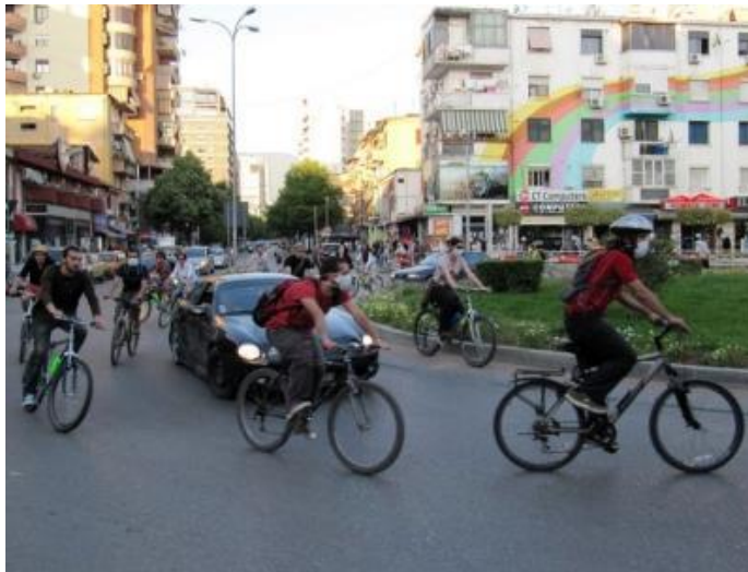
Critical Mass, Tirana 2014

The good news is that Tirana is in a favourable position to support a transition to alternative modes of transport, as its terrain is mostly flat and it is a compact city with work, services, and social contacts typically within walking distance. Current feasibility studies on mobility and sustainability recommend high impact and low cost strategies for Tirana.